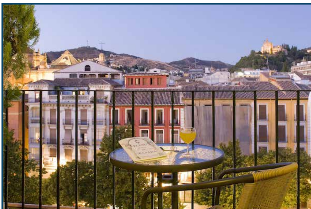
Hotel Los Tilos